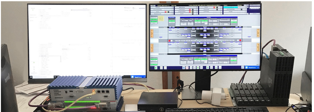
Nabla testing setup with an integrated Mobile real-time target machine

The tunnel simulation model, designed in Simulink, runs in real-time on a Speedgoat target computer which is connected to a Siemens PLC via the PROFIBUS